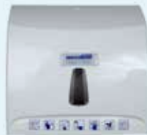
Wall dispenser microfibre cloth on a roll