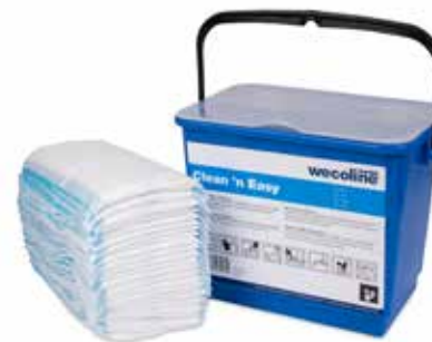
Non-woven floor mop in bucket