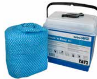
Dispenser bucket with ready-to-use cloth on a roll for the interior

This product is ready to use. Single use is the best solution for fast and effective cleaning in areas where hygiene is important.