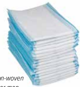
Non-woven floor mop, refill

See how EASY it is to use our Wecoline Clean 'n Easy Superior Single Use concept: