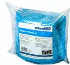
Refill packaging for the interior